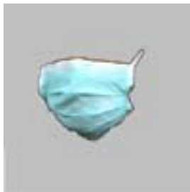
Triple layer Mask