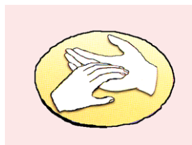
Step 5. Wash fingertips.