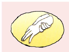
Step 6. Wash wrists.