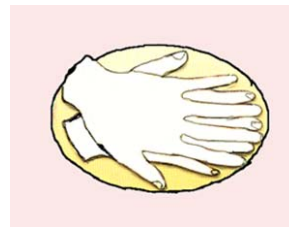
Step 2. Wash back of hands.