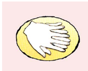
Step 1. Wash palms and fingers.