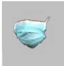
Triple layer Mask